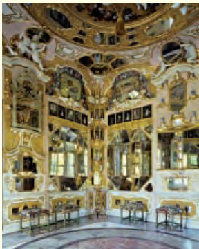
Hall of mirrors

the unconventional hermitage with its chapel of Mary Magdalene, which offered Sibylla Augusta a place of retreat.